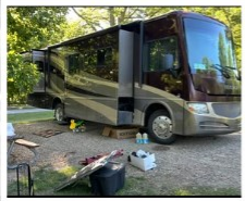
Additional photos available upon request.